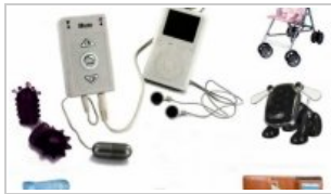
iBuzz: Feel the Music in a Whole New Way!