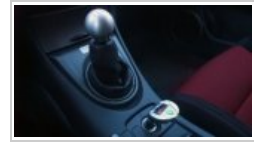
Video: SoundRacer V8 turns your boring family car into a fire-breather