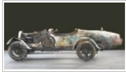
This car sold for US$360,000 in this condition ... and will not be restored