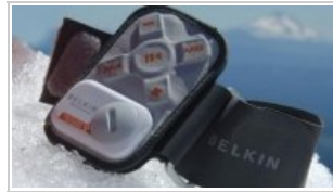
The SportCommand wireless fabric remote control for an iPod