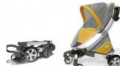
The self-folding Origami stroller: a cool name for a compact kid carrier