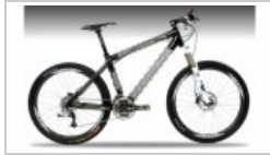
IsoTruss-tubed Delta 7 bikes look funny, but boast high strength to weight ratio