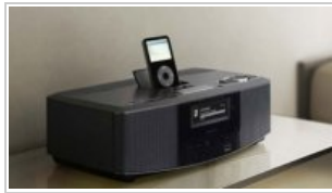
S-52 joins Denon's S series of compact music player