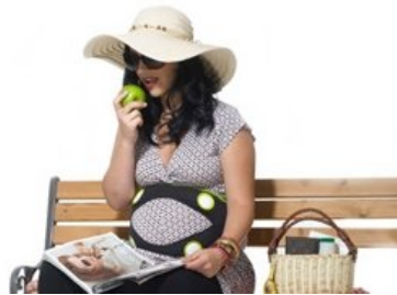
With the Ritmo pregnancy belt, you and your baby can listen to music at the same time