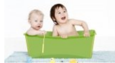
Flexi-bath folds up flat when baby's bath time is over