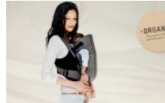
Baby Bjorn goes organic with its new baby gear