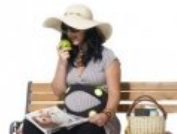
Nuvo's Ritmo is an advanced sound system for the next iPod generation