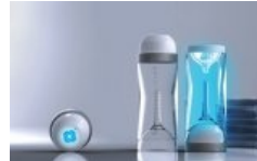
Pureray ultraviolet baby bottle sterilization concept