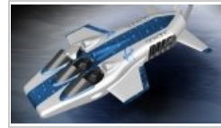
Necker Nymph: underwater flying becomes Virgin territory