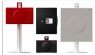
CES 2006: Taking 'iPod Docking' to a new level