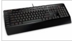
Microsoft's SideWinder X4 Keyboard ain't afraid of no ghosting