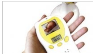
Wireless, handheld Baby Monitor with video