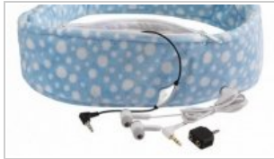
Lullabelly prenatal belt plays your favorite tunes to your child