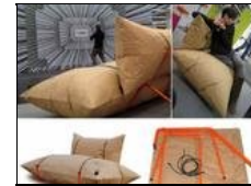
Blow Sofa: Carry the furniture wherever you go!