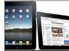
Apple iPad tablet, it's here for real and this is what it's got