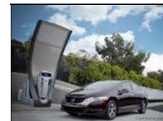
Honda unveils next-gen Solar Hydrogen Station for home refueling