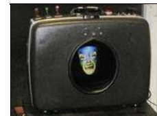
Magic Suitcase DIY speaks your language